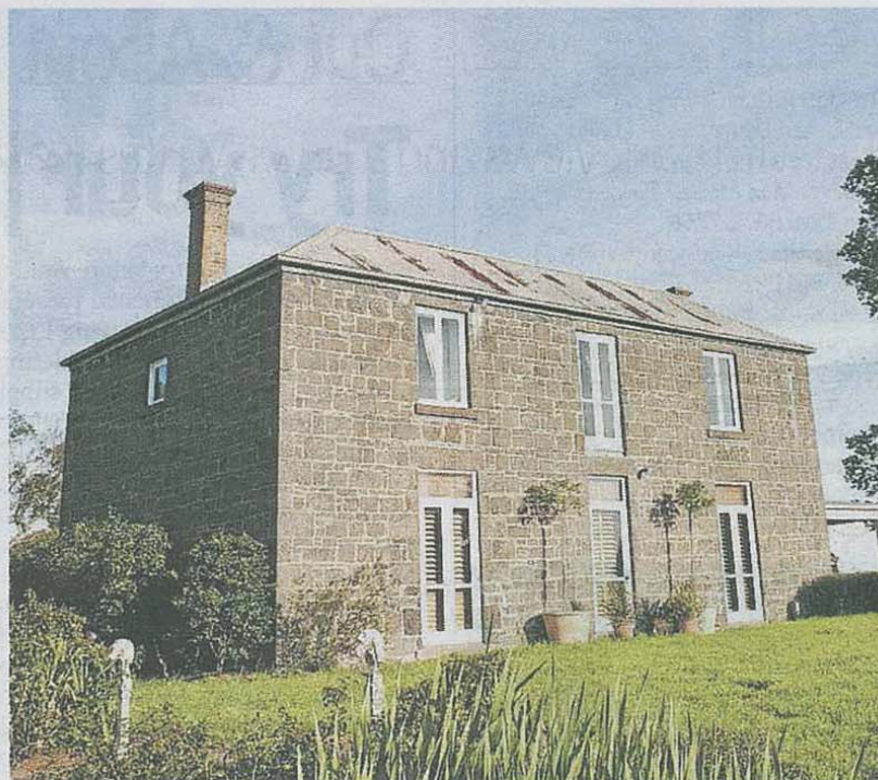
Named after this 1860s bluestone homestead, Fairview estate will retain rural views.

The two small commercial centres planned for Mernda have yet to eventuate and, for now, locals must travel to shop. Bridge Inn Road forms a handy east-west connection